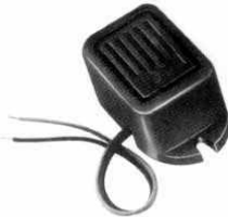
EMX-300L 1 SERIES